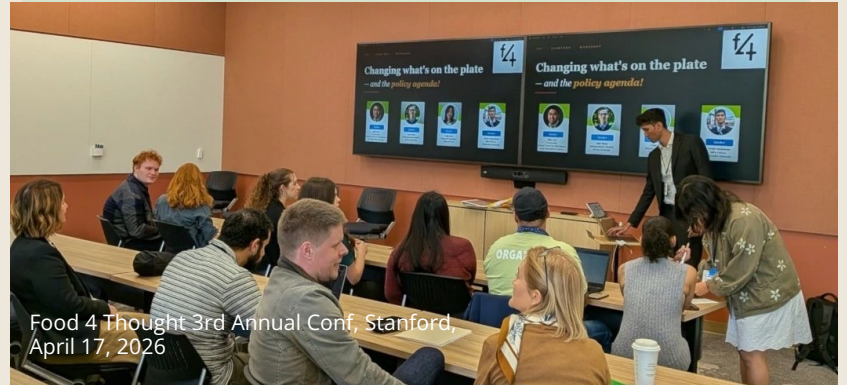
Food 4 Thought 3rd Annual Conf, Stanford, April 17, 2026

We've become known for our Knowledge Sharing Initiative which hosts ongoing virtual monthly webinars, an annual summer student reverse career faire event, and annual conference. We also supervised original field research in East Africa, and presented at numerous aligned events to grow support!