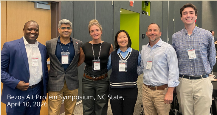
Bezos Alt Protein Symposium, NC State, April 10, 2026

Build a global safe space for an inclusive, people-centered approach to plant-based and alt proteins focused on cultures, culinary traditions, livelihoods, public health, climate resilience, economic development, and equitable, accessible, and affordable food systems, especially in the Global South.